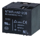
32.4×27.5×28.0(NT90T 2 )